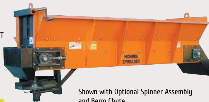
Shown with Optional Spinner Assembly and Berm Chute