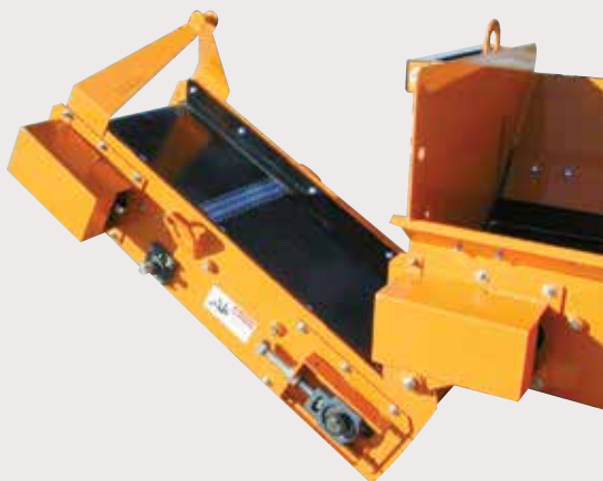
Optional 4' Extension with caged rollers