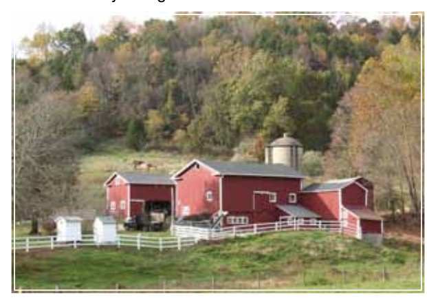
Platt Farm, 538 Flood Bridge Road

This guide to Southbury's South Britain Historic District and a companion guide to the Main Street Historic District are designed to introduce residents and visitors to Southbury's architectural and historical assets. Because of the town's rich historical legacy, only a sampling of individual sites can be listed. For more information about the history of Southbury we encourage you to visit the Old Town Hall Museum in South Britain or the Town of Southbury website: www.southbury-ct.org