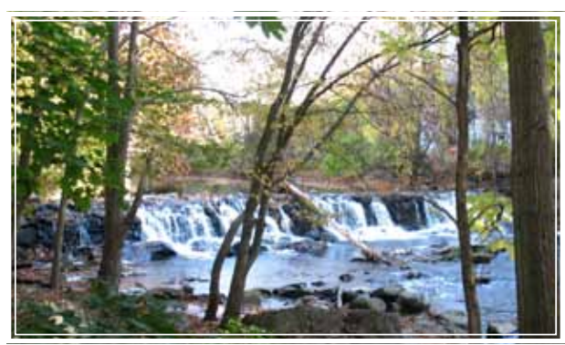
Evidence of South Britain's former importance as an industrial center may be seen in the remnants of the dam and bridge abutments over the Pomperaug River, located west of South Britain Road, and in the extant sections of a diversion canal along the riverbank near the former Hawkins Factory.

Settled early in the 18th century as a part of Southbury, South Britain was recognized as a separate parish, or ecclesiastical society, in 1766. The settlement soon became a center for water-powered industries made possible by the damming of the Pomperaug River. Prior to the Revolution, South Britain had a grist mill, sawmill and fulling mill, and by 1798 a three-story mill to make carpet yarns. In the mid-19th century South Britain prospered as a flourishing village with many industries and trades, including a tannery, carriage shop, three hat manufacturers and the Curtis woolen mill with 50 employees. The South Britain Water Power Company was formed in 1853 to create additional power, with a plan to divert water from the river to supply a huge reservoir. These plans did not materialize, and as steam power overtook water power, South Britain was eclipsed by other industrial centers.